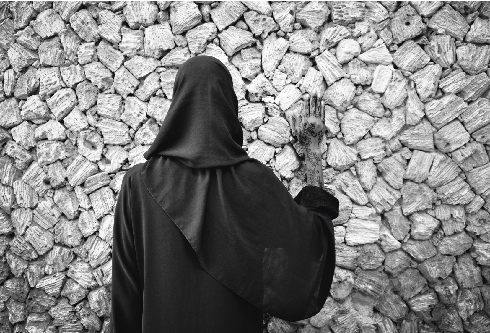
▼ Walls in Lamu are traditionally built using coral found on the beach. Here, this Muslim woman comes face to face with the coral wall, symbolic of both the boundaries she lives within but also that provide safety and protection.

Beyond this natural connection, there is a far stronger force at play; an overwhelming intrigue and respect for the women who live there. A chance to quite literally shine a light – the incredible tropical equatorial light – on these women as they go about their daily lives.