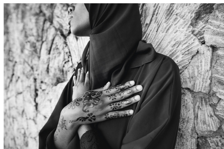
▲ The local Swahili culture and architecture, with beautiful houses and amazing inner courtyards, form the backdrop to photographing these beautiful women.

"There are so many cultural and religious influences in Lamu that you cannot help but be captivated by it. Especially by the women who have found strength in difference and harmony in acceptance and friendships that are not bounded by cultural or religious differences."